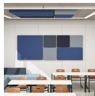
Unterschiedliche Größen und Stofffarben