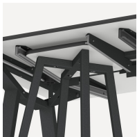
Halterung für FLEXLAB Hocker und Tidy Boxen