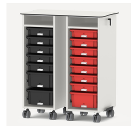
Zusätzliche Arbeitsfläche durch Aufsatzplatte

Our range of materials and colors can be found in the A2S material overview.