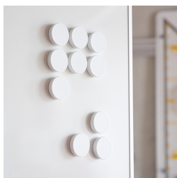
Holding magnets with 700g adhesive force

Our range of materials and colors can be found in the A2S material overview.