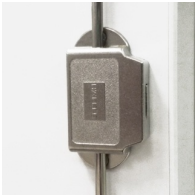
High quality locking bar