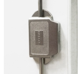
High quality locking bar