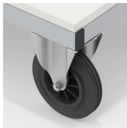
Smooth-running, heavy-duty hard rubber casters, steerable on one side with stop