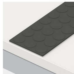
Abrasion resistant slip stop with knobs