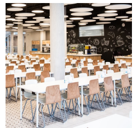
Proven many times in open plan and canteen

Our range of materials and colors can be found in the A2S material overview.