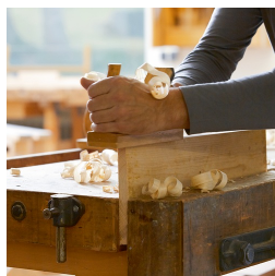
Solid beech wood from sustainable forestry with water-based varnish