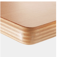
Seat made of beech multiplex, HPL coated