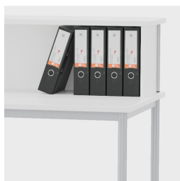
High and deep enough for standard binders