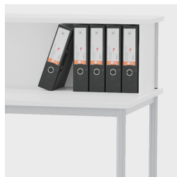
High and deep enough for standard binders