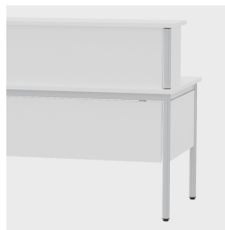
Elegant look: continuous table leg

Our range of materials and colors can be found in the A2S material overview.