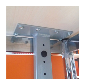
Firmly screwed with table top