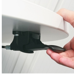
Ergonomically shaped hand release for easy height adjustment