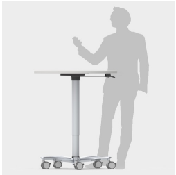
Can also be used as a mobile lectern