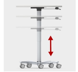
Infinitely height adjustable in the range of 30.31"-45.67"