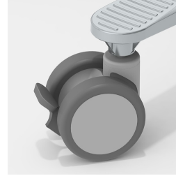
Including 5 robust double swivel casters with total locking device