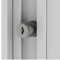
Roller sliding doors lockable