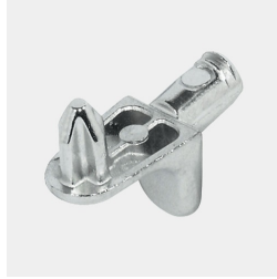
Pull-out proof shelf supports