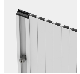
Stable guide rails