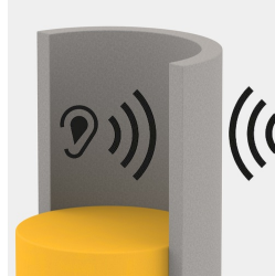
Sound insulation through sound absorbing foam in backrest