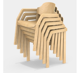
Stackable up to 6 chairs