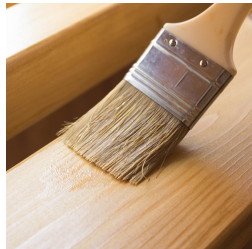
Painted with environmentally friendly water-based paint.