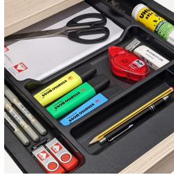
utensil drawer for office supplies