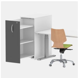
Provides more privacy at work