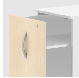
Roll container lockable incl. two keys