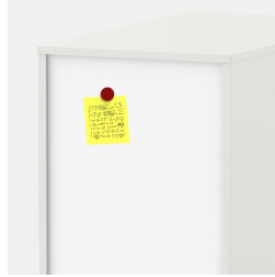
Optional magnetic back panel