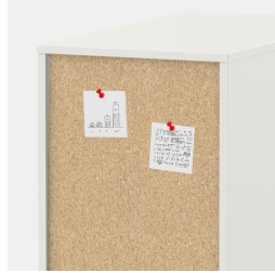
Back wall optionally covered with cork