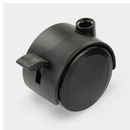
Mobile on 4 lockable double castors