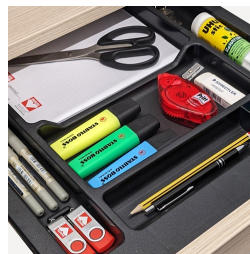
utensil drawer for office supplies