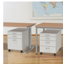
Suitable for our OFFICE tables and 1000, 2000 table series