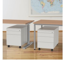
Suitable for our OFFICE desks and 1000 and 2000 desk series