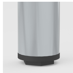
Floor protector with level compensation: compensates for uneven floors