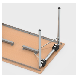
Easy folding of the table legs