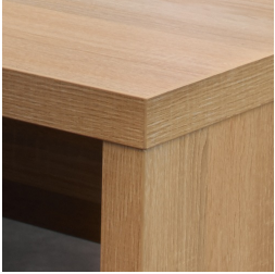
Surface melamine coated with robust plastic edge