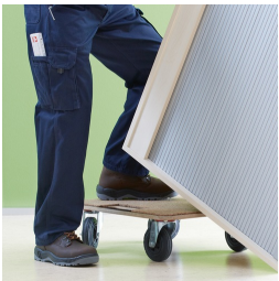
Carcass firmly dowelled and glued ex works