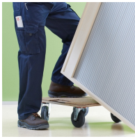
Carcass firmly dowelled and glued ex works