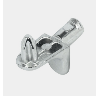
Pull-out proof shelf supports