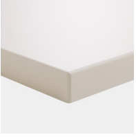
Board material melamine coated with robust plastic edge