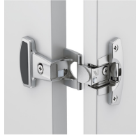
Metal cup hinges with 240° opening angle