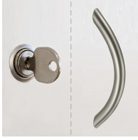
1 OH cabinet with handle or lock