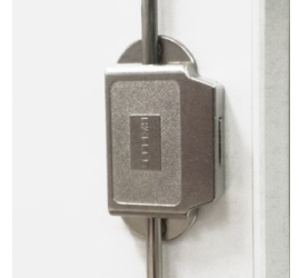
High quality locking bar