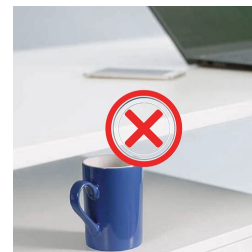
Collision protection minimizes the risk of damage when moving up and down