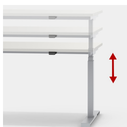
Infinitely and quietly height adjustable in the range 62-127 cm