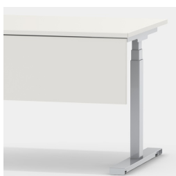
Matching accessories: front panel model 2050.142