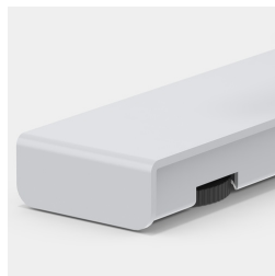
Floor protectors with level compensation for easy leveling of uneven floors