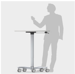
Can also be used as a mobile lectern