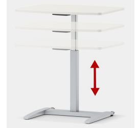
Infinitely variable height adjustment in the range 27.56"-43.31"