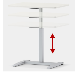
Infinitely variable height adjustment in the range 27.56"-43.31"