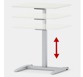
Infinitely variable height adjustment in the range 27.56"-43.31"