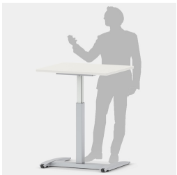
Can also be used as a mobile lectern