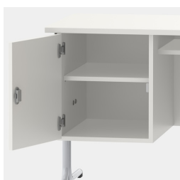
Base cabinet includes one shelf, lockable by means of security lock