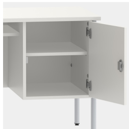
Base cabinet includes one shelf, lockable by means of security lock