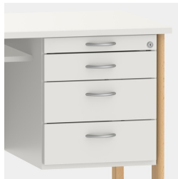
Base unit includes pencil drawer and drawers with soft-closing mechanism and central locking system