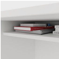
Including practical tray