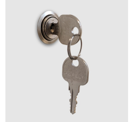
Cupboard with central locking