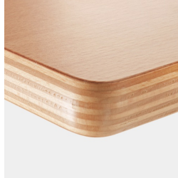
Optional table top multiplex melamine coated