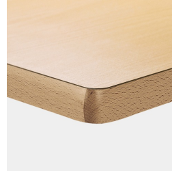
Optional melamine coated table top with solid wood edge