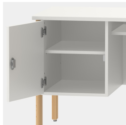
Base cabinet includes one shelf, lockable by means of security lock