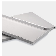
Stable steel bases