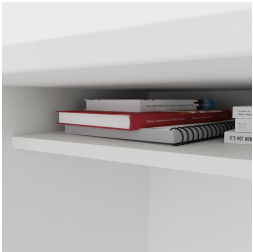
Including practical tray