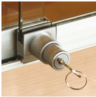
Lockable glass sliding doors