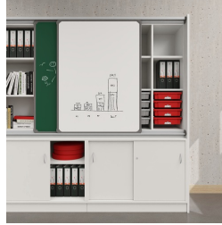
Shelf attachment with tidy boxes behind the panels