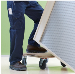
Carcass firmly dowelled and glued ex works