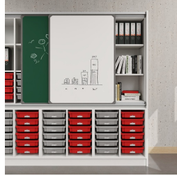
Sliding panel with aluminum guide rails and additional storage space behind the panels