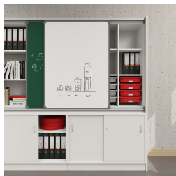
Shelf attachment with tidy boxes behind the panels