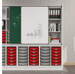
Sliding panel with aluminum guide rails and additional storage space behind the panels