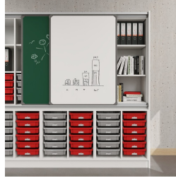
Sliding panel with aluminum guide rails and additional storage space behind the panels