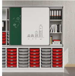
Sliding panel with aluminum guide rails and additional storage space behind the panels