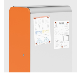
Optionally with magnetic pages