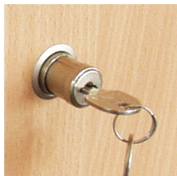
Sliding doors lockable