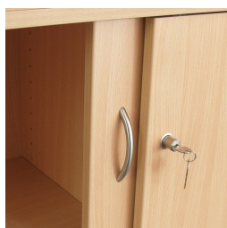
Smooth sliding doors