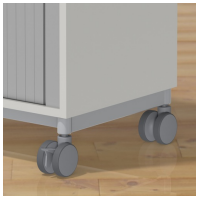
Pupil compartment shelves optionally mobile with castors.