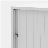
Handle with recessed grip base