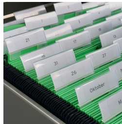
Including hanging file drawer