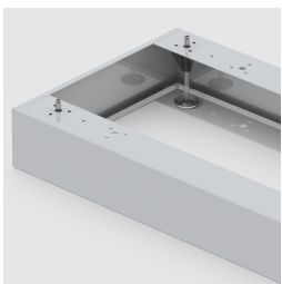
Optionally with robust steel base