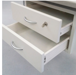
Lockable school bathroom cabinet included