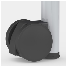
Optionally mobile with 2 casters