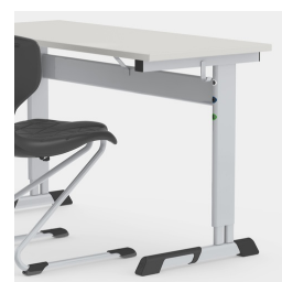
Due to C-shape no disturbance of the table legs when getting in and out of the table