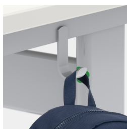
Includes one satchel hook per seat