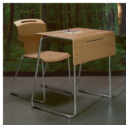
Slim cross section and modern design