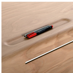
Pen tray included